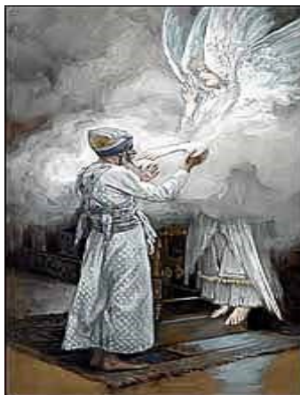
Zechariah burned incense in the temple when an angel appeared to him (Luke 1:9-10). James J. Tissot, 'The Vision of Zecharias' (1886-94), gouache on gray wove paper, Brooklyn Museum, New York.

In Revelation, they offer before the throne "golden bowls full of incense , which are the prayers of the saints " (Revelation 5:8; cf. 8:3-4). These prayers smell sweet to the Lord.