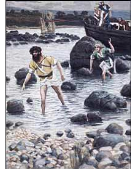
James J. Tissot, 'The Calling of Saint James and Saint John' (1886-94), gouache on gray wove paper, 7.6 x 5.75 in., Brooklyn Museum, New York.

Now the sail comes down and Peter becomes the paragon of efficiency. He'll show Jesus how real fishermen do things -- even if they don't catch anything. One end of the net goes over the side, and Peter and his crew play out the long net until it is extended full length, floats bobbing on the surface. Now he fastens the other end of the net to the far end to the boat.